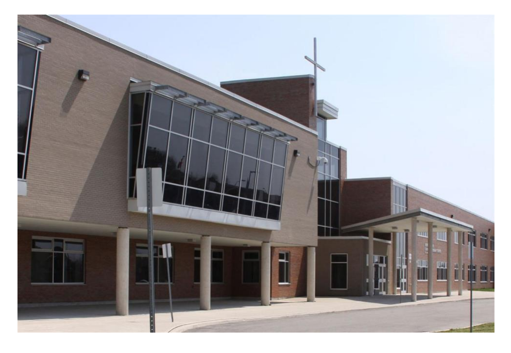
Bishop Tonnos Catholic Secondary School, located at 100 Panabaker Drive, Ancaster. Opened February 2005.